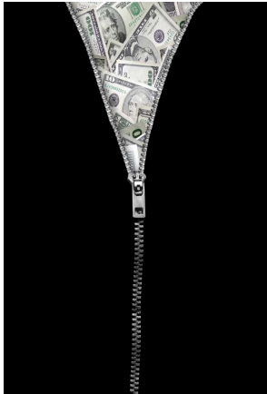
Final Payment Is Now Due!